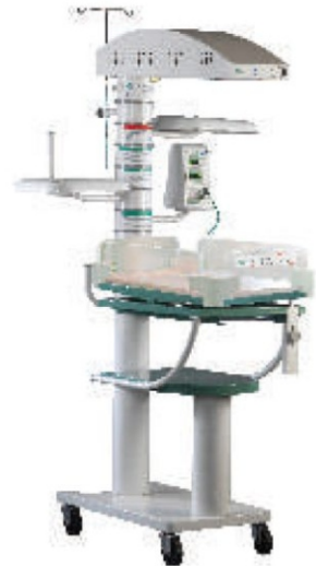
JEEVAK Servo Open Care Incubator