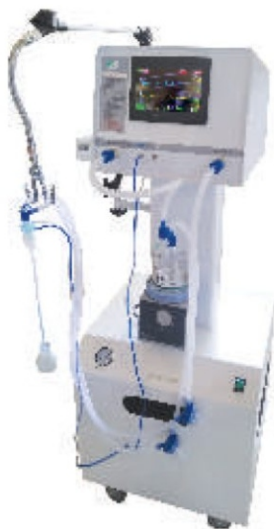
NEONATAL VENTILATOR Model: Shreeyash SW21