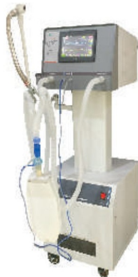
ADULT VENTILATOR Model: Shreeyash 900